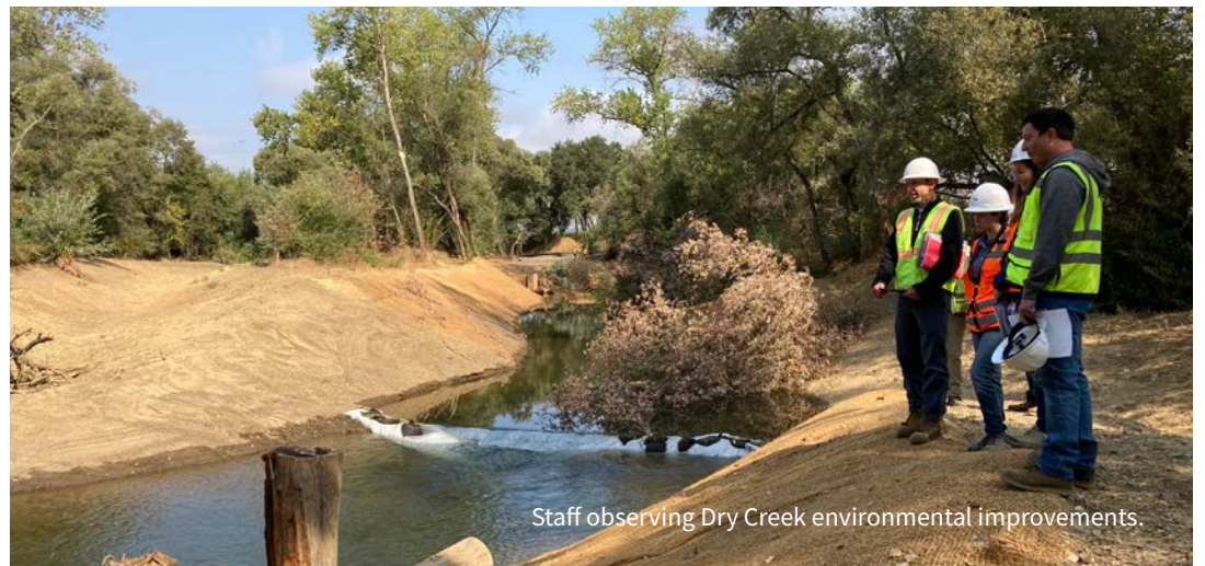
Staff observing Dry Creek environmental improvements.