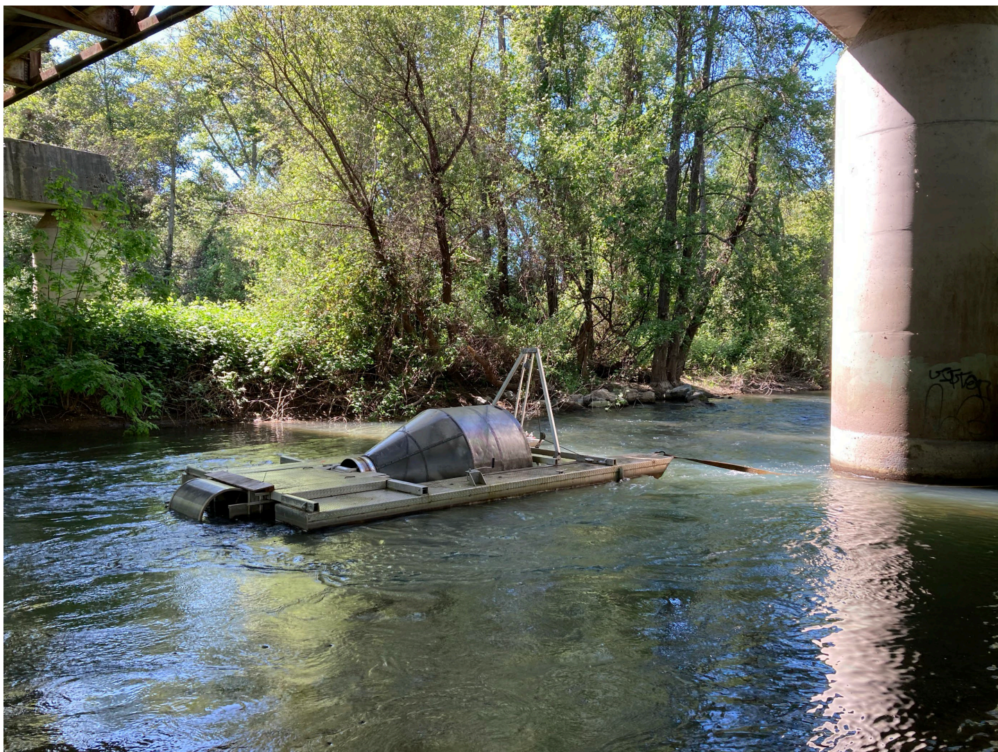
A downstream migrant trap on Dry Creek.