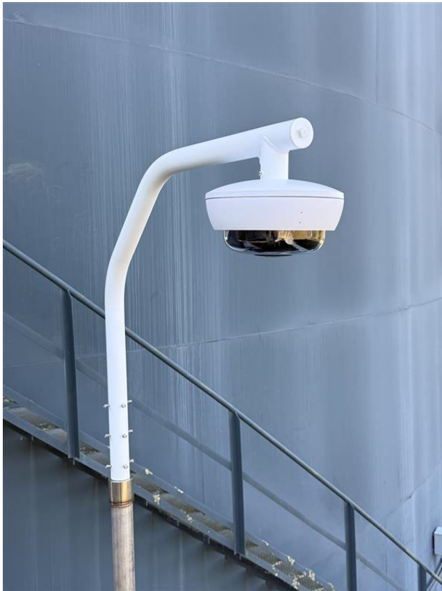
New camera at Cotati #1