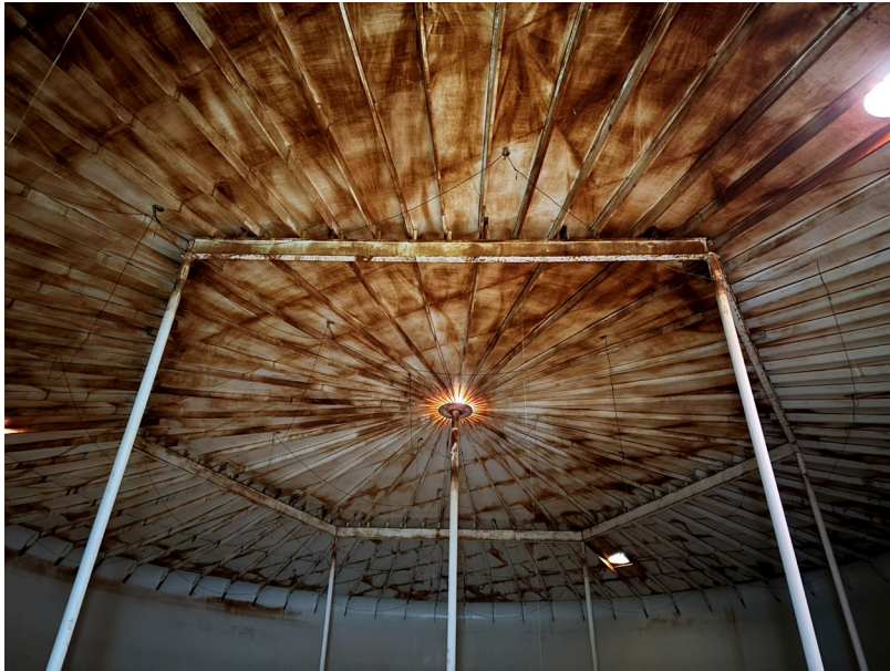
Oxidation encountered in the annular space