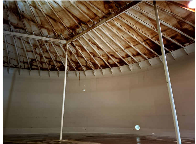
Twisted Beams encountered during inspection