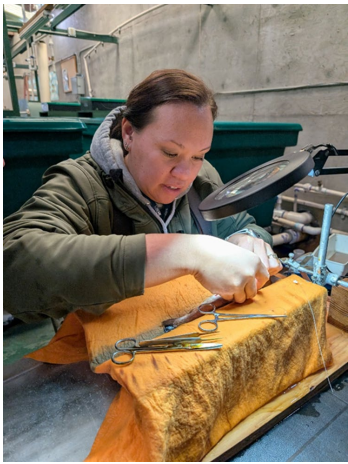
Photo: Fisheries technician surgically implanting a radio telemetry tag in a steelhead smolt.

from the hatchery. As of April 21, 2026, 64 of the 70 smolts were detected in Ukiah, 42 in Hopland, 26 in Alexander Valley, 21 at Mirabel Dam, and 18 at Duncans Mills. Average daily flow at Hopland was 232 cfs on the day of release. Flow at Hopland three days after release increased following rain events to 1,360 cfs and to 8,650 cfs 12 days after release. A second group of 76 radio tagged smolts were released from the hatchery on March 13, 2026. As of April 21, 2026, 54 of the smolts were detected in Ukiah, 35 in Hopland, 15 in Alexander Valley, 10 at Mirabel Dam, and 7 at Duncans Mills. Average daily flow at Hopland on the day of release was 350 cfs and has remained below 500 cfs since the release. The raw number of detections reported here for each site are not survival estimates since these detections do not yet account for detection efficiency, delayed emigration, or tag retention.