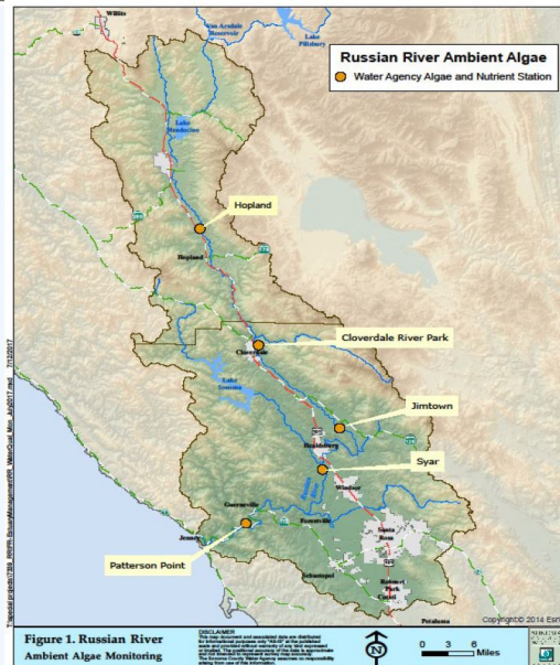
Russian River Water Quality Grab Samples